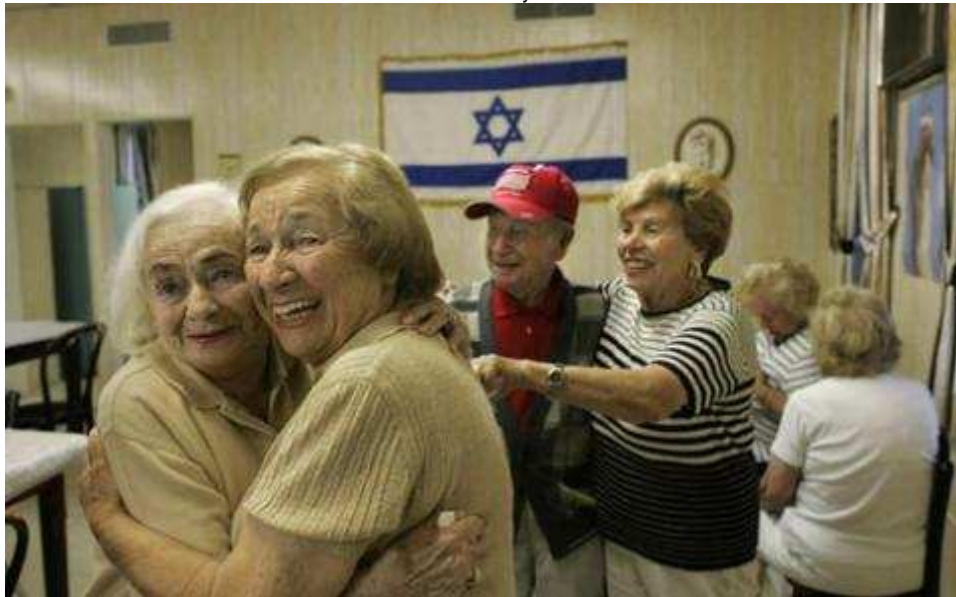
OLD JOY Elderly vacationers find heaven on the dance floor.