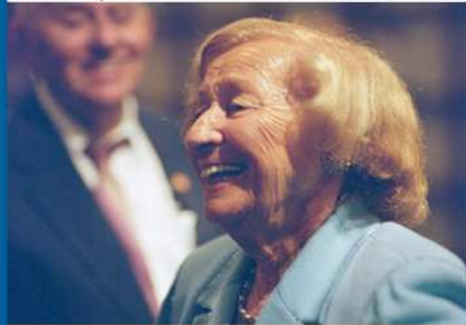
A scene from Andrew Jacobs' "Four Seasons Lodge."