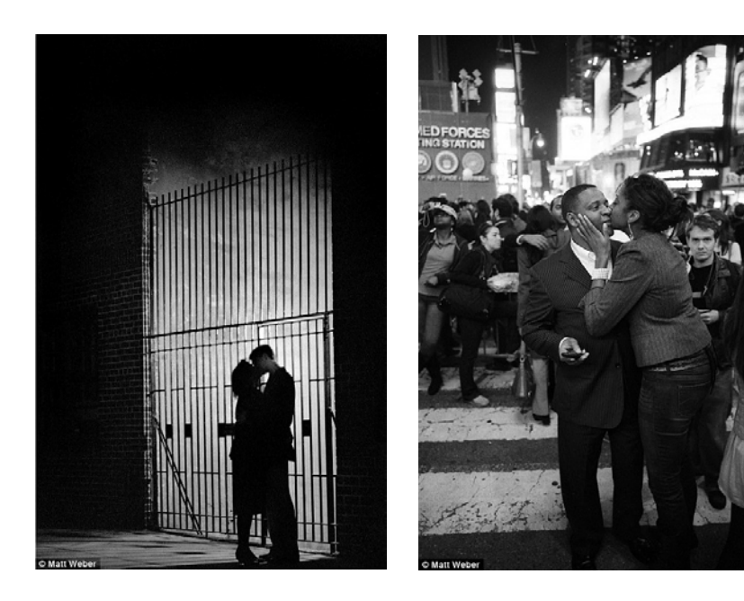
Making history: A couple embraces in Midnight Kiss, taken in 1989 (left), and a woman kisses a man following the election in Obama Victory Kiss, taken in 2008 (right)