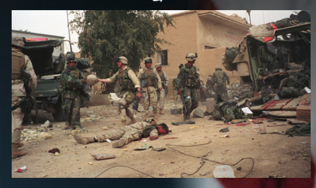
"Fascinates...suspenseful." -Long Island Press