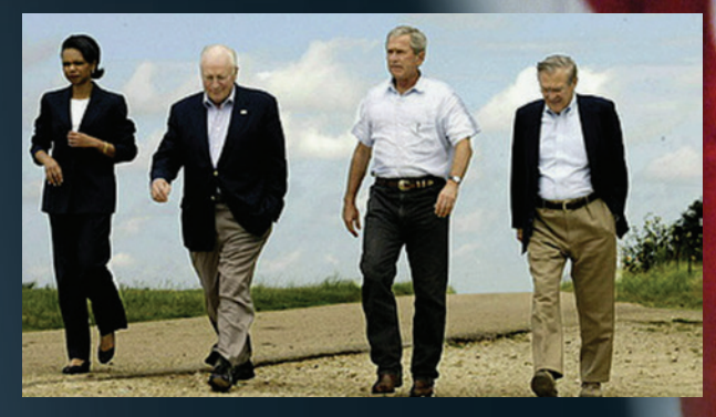
"Passionately sets out Bugliosi's premise...he makes a terrific argument for his position." -Wolf Entertainment Guide