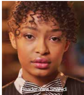
Reader Yara Shahidi

Interwoven with the stories and readings is the history of the man who created it. Joseph Pulitzer, who came to America to fight as a mercenary in the Civil War, left money to Columbia University upon his death in 1911. A portion of his bequest was used to establish the Pulitzer Prizes, which were first awarded in 1917. Today, the iconic prizes represent the highest standards of integrity and excellence in the arts.