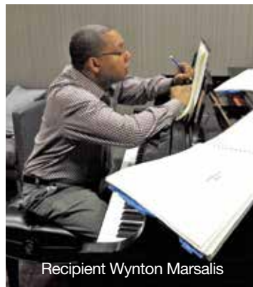
Recipient Wynton Marsalis