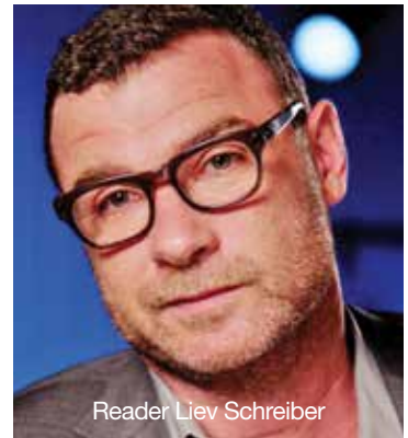
Reader Liev Schreiber